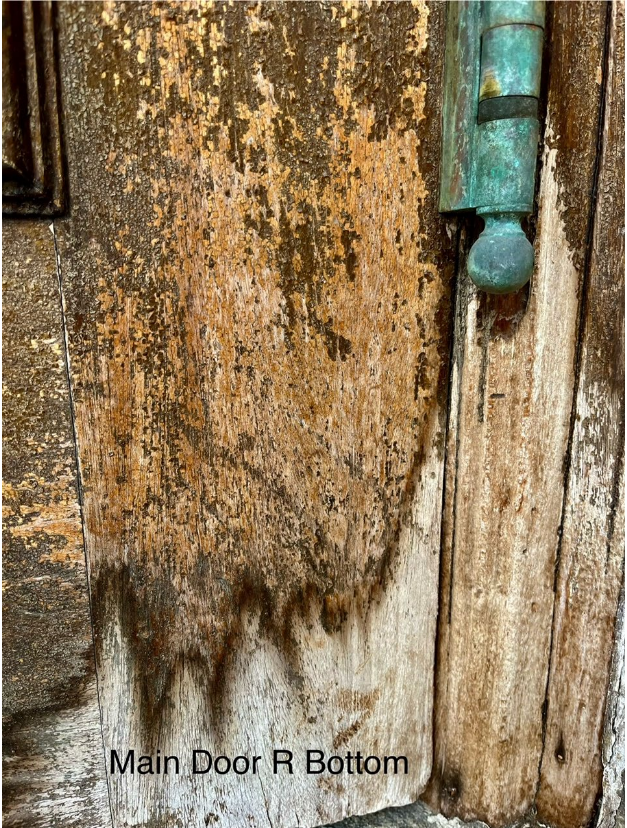
Main Door R Bottom