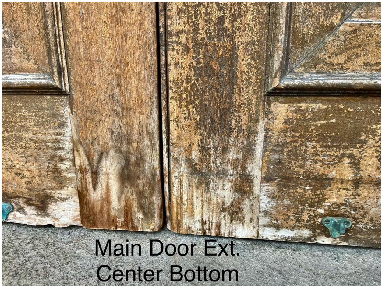
Main Door Ext. Center Bottom