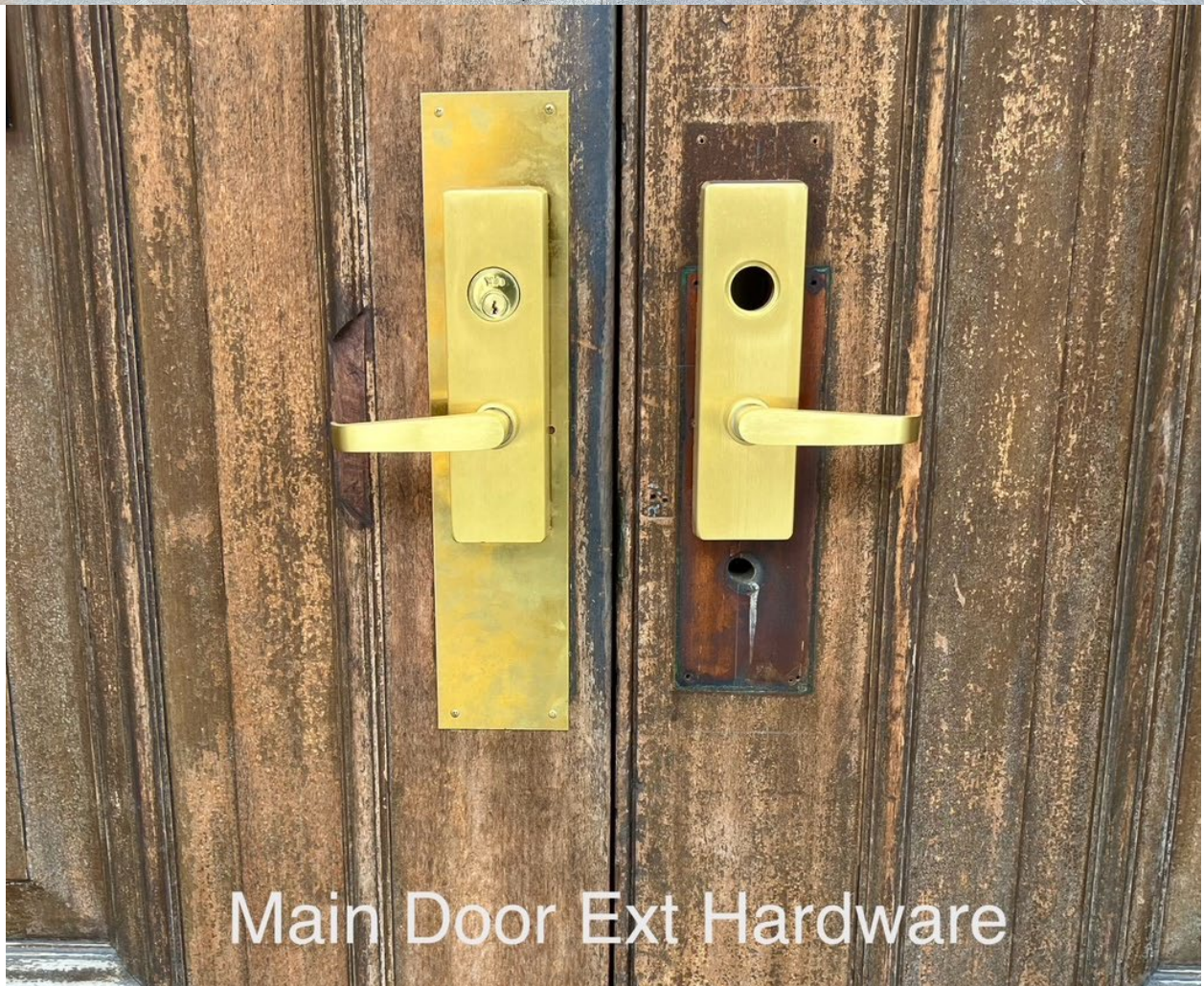
Main Door Ext Hardware